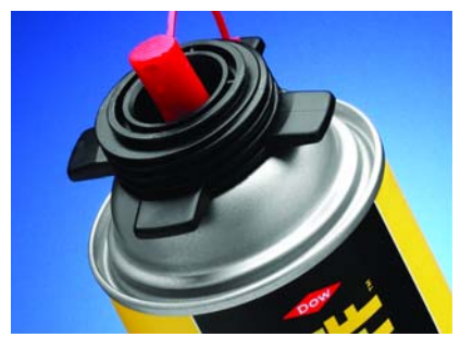
Cleaner with red spray nozzle attached.

Uncured GREAT STUFF PRO™ Insulating Foam Sealant and Adhesive can be removed from the adapter and the gun's exterior surface with GREAT STUFF PRO™ Gun Cleaner, using the red spray nozzle attachment.